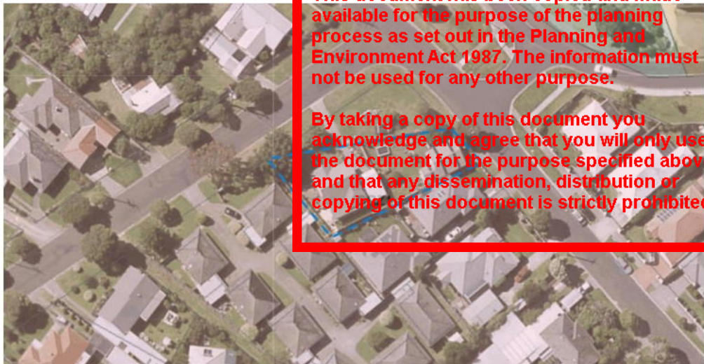
Figure 1 | Aerial image of the subject site

This document has been copied and made available for the purpose of the planning process as set out in the Planning and Environment Act 1987. The information must not be used for any other purpose.