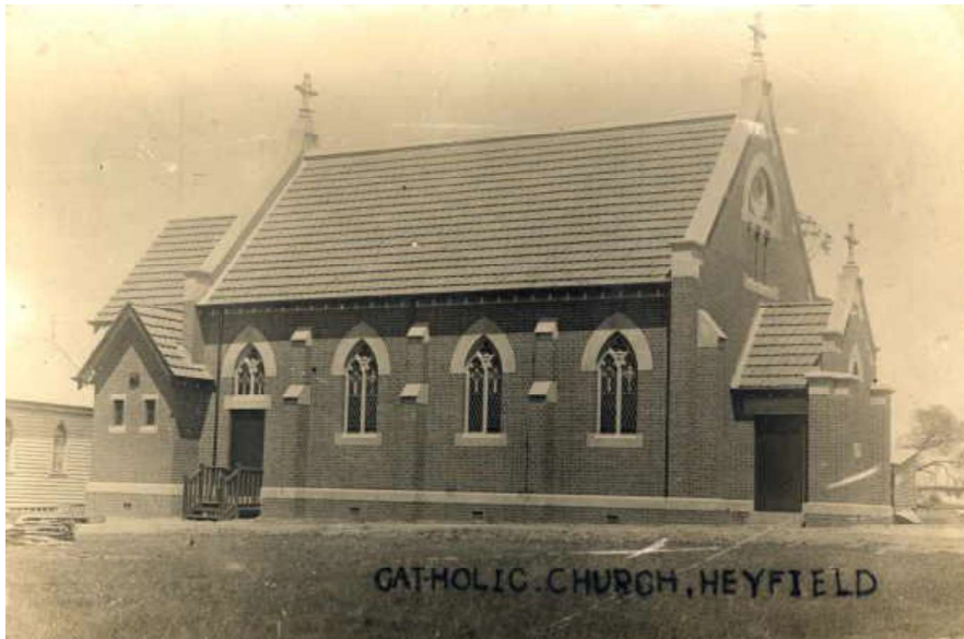
Figure H3. The church between c1909 and 1940, as viewed from the east, before the construction of the transepts.