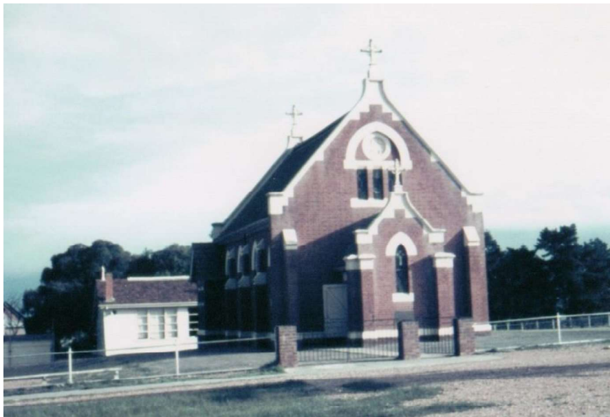
Figure H4. Photo dating to c1960s. St Michaels Catholic Primary School occupied the site by this date. The transepts had still not been built by this date. On the northern boundary were brick piers with steel gates, with a simple wire and metal pole fence. (HDHS).