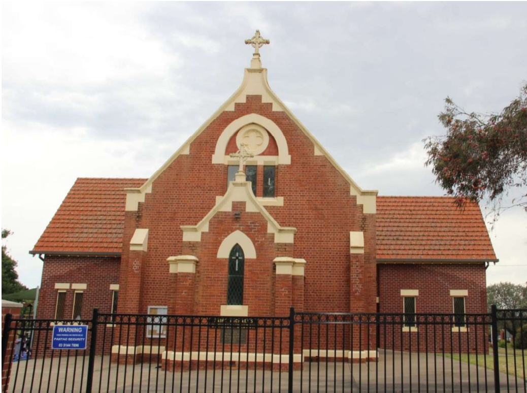
Figure D1. The tuckpointed red-brick church has a gabled roof clad with terracotta tiles, with rendered dressings and coping (overpainted) to the gable parapets, buttresses, plinth, and sills and lintels of the openings. Central to the façade is the gabled entrance porch, below the large pointed-arch window to the gabled end. Two substantial transepts were constructed (c1969 and c2000), projecting to the east and west.