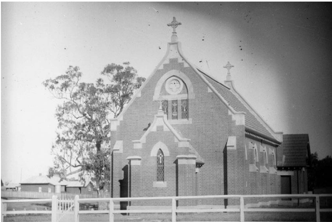
Figure H2. An early photo of the church (date not known), showing the original extent. A timber post and rail fence lined the front boundary (HDHS).