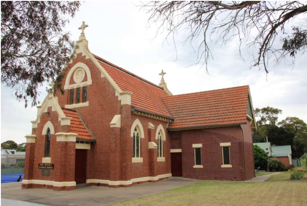
Figure D3. Either side of the entrance porch are timber doors, entered via bluestone steps.

inset cross) with a foil motif at the peak.