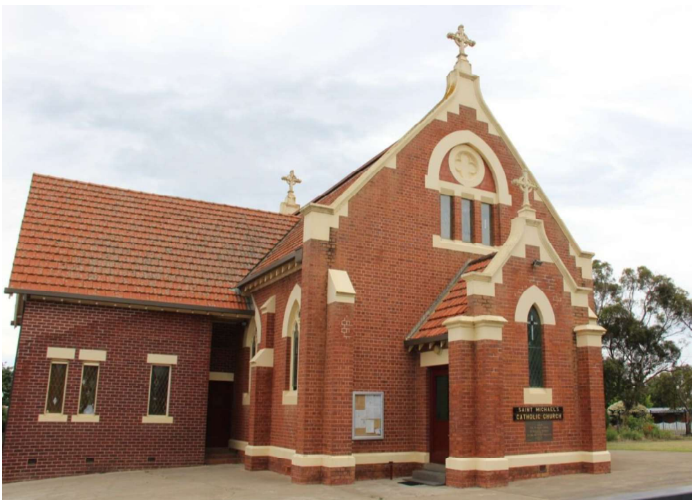
Figure D2. Projecting rafter ends are exposed beneath the eaves of the church. The two front bays of the side elevations of the 1916 church remain visible. Each bay has a pointed-arch window; set within is a trefoil above a pair of leadlight windows (with a diaper pattern and