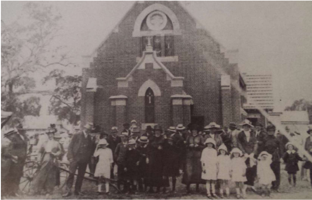
Figure H1. Early photo of the church which may date to soon after the completion of the church. The transepts were not built at this date (FitzGerald 1991:62).