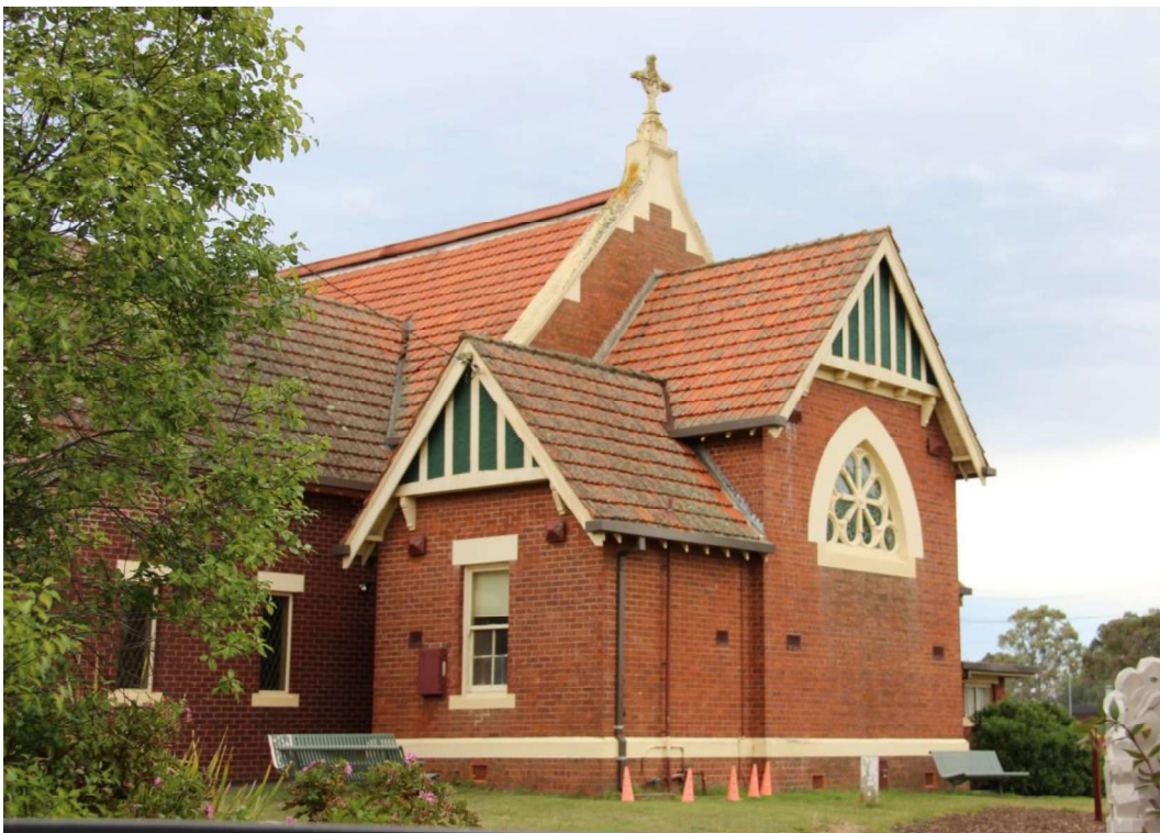
Figure D4. The rear (south) of the church retains the original chancel and two vestry buildings, which project off the chancel to the east and west, all of which continue the detail of the nave. The south elevation of the chancel has a wide pointed-arch opening with a leadlight rose window.