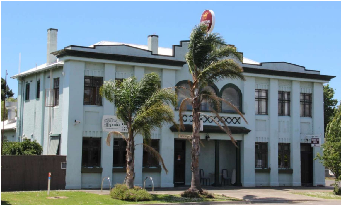
Figure D1. The two-storey symmetrical facade dominates the street with its Stripped Classical style. At the roofline is a low three-part parapet which sits above a bold cornice. Eight smooth-rendered engaged piers divide the facade into distinct vertical bays, with a large central bay with a recessed porch at ground level and balcony to the first floor.

Aerial. Modern additions extend to the rear of the hotel. Outbuildings are located at the rear of the property (dates not confirmed).