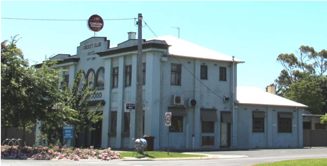
Figure D3. View of the two-storey and single storey elevations. The two storey section has steel-framed windows with the same detail as those of the façade.