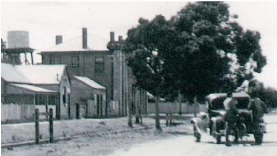
Figure H2. This photo (date not known; cars date to c1930) shows that the windows have been inserted by this date on the west elevation (HDHS).