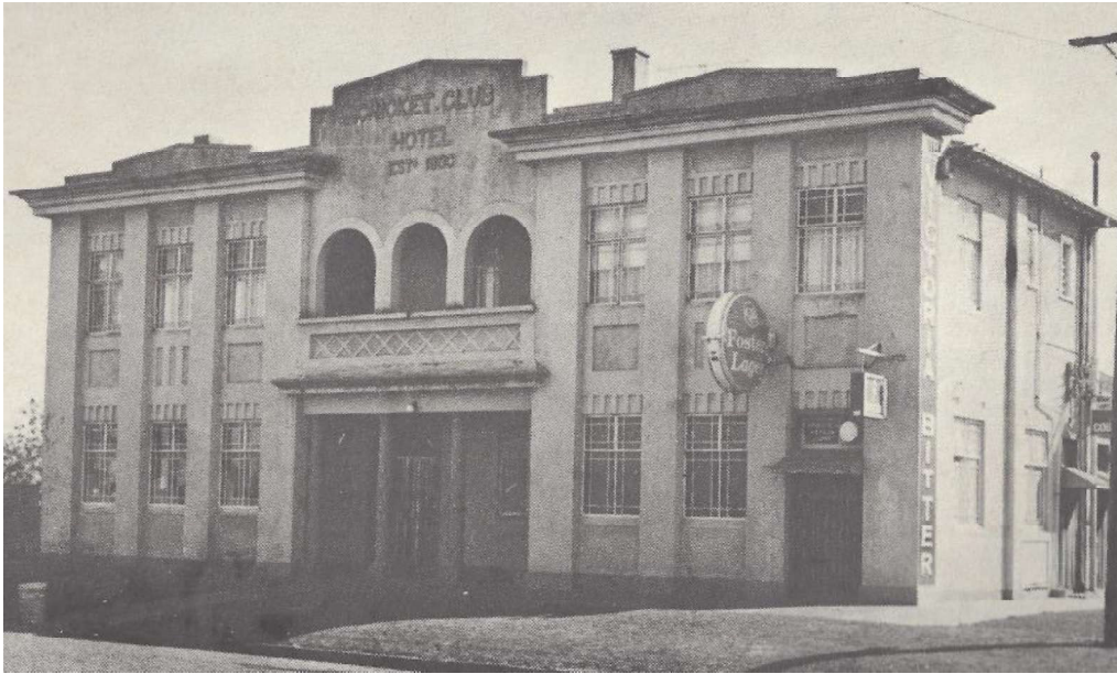
Figure H3. A photo dating to 1971 that showed the unpainted facade and east elevation, with details as they appear in 2015 (Maddern 1971).