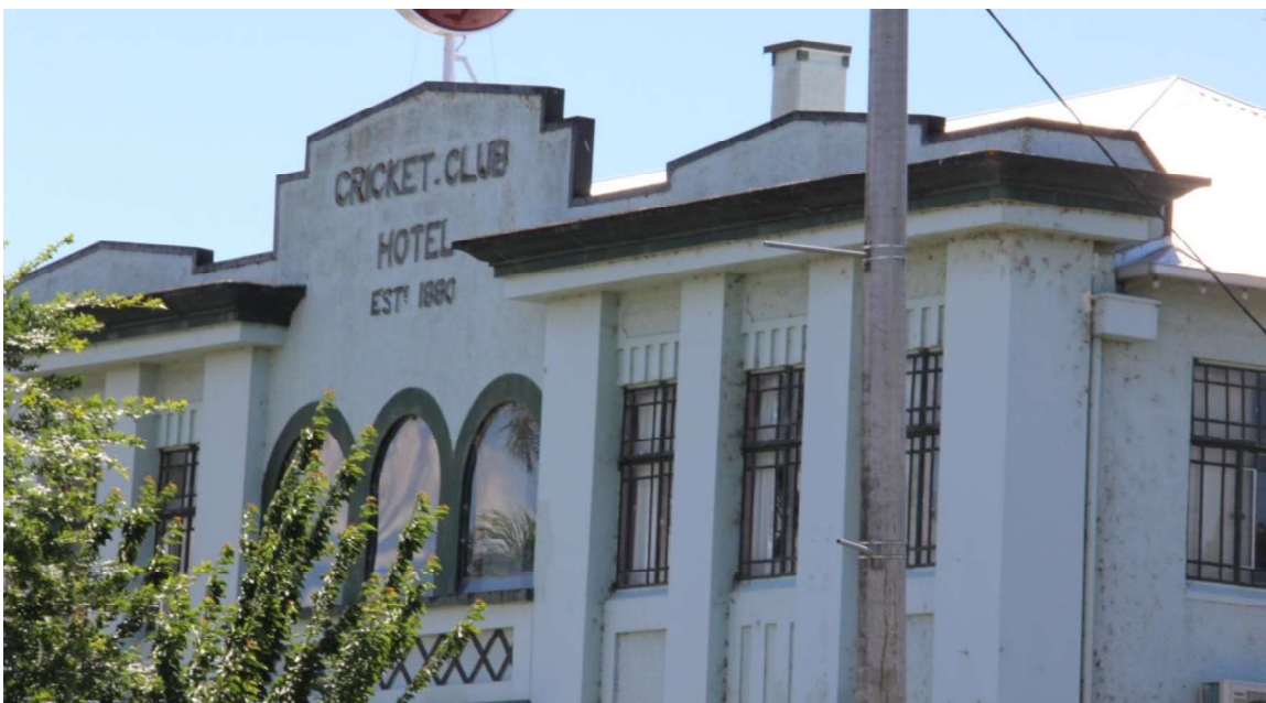
Figure D2. The central parapet to the facade reads 'CRICKET CLUB HOTEL ESTD 1880' in relief. Below are three round-arched openings, with rendered frames, which open into the balcony to the first floor. The windows are ornate steel-framed multi-paned casement windows, with opaque glass to the outside panes.