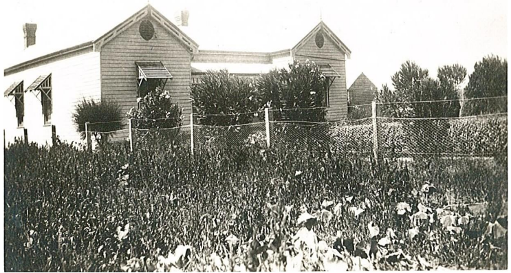
Guthridge Parade 0052, ID 1213iii.jpg