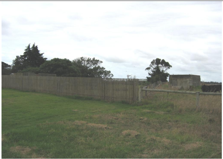
Tannery Rd 0332 CorcoranTannery2 , ID 1332ii.JPG