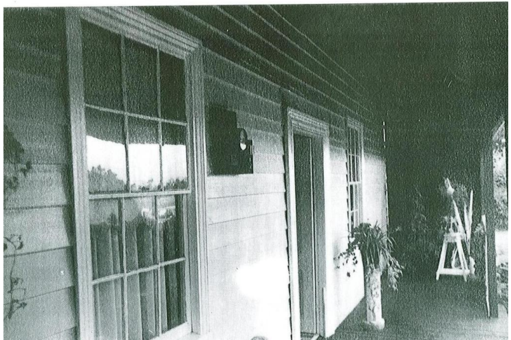
■ 21: House, Tannery Road at Myrtle Point