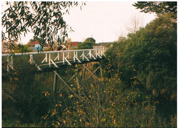
UpdateMacalister St Bridge, ID 1032(i).jpg