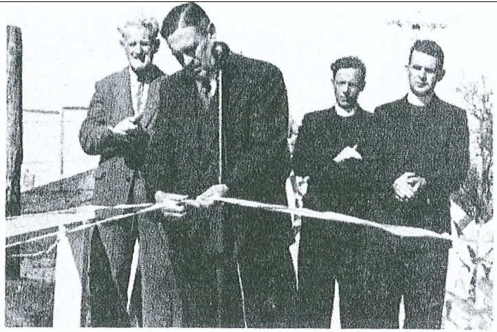
HIS WORSHIP THE MAYOR CUTS THE RIBBON 1953