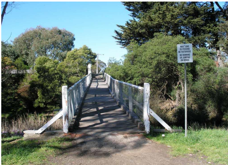
UpdateMacalister Street Bridge, ID 1032(vi).jpg