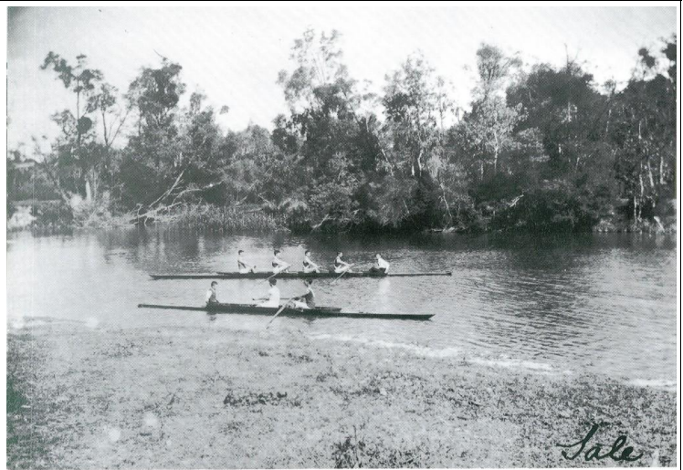
SALE ROWING CLUB CREWS ON THE THOMSON RIVER 1912